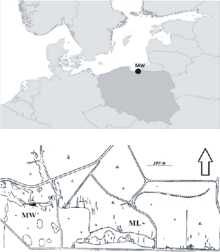
Fig. 1. Location of Mierzeja Wiślana ringing station (above) and a map of two sub-stations – MW and ML (below); after Busse and Kania 1970.