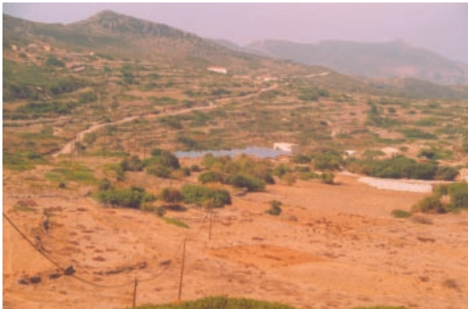
Plate II-2. A view of the island. The ringing place is the area with vegetation. The building at the top of the photo is the Ornithological Station