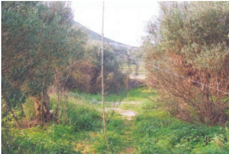
Plate I-2. A net site in an olive grove