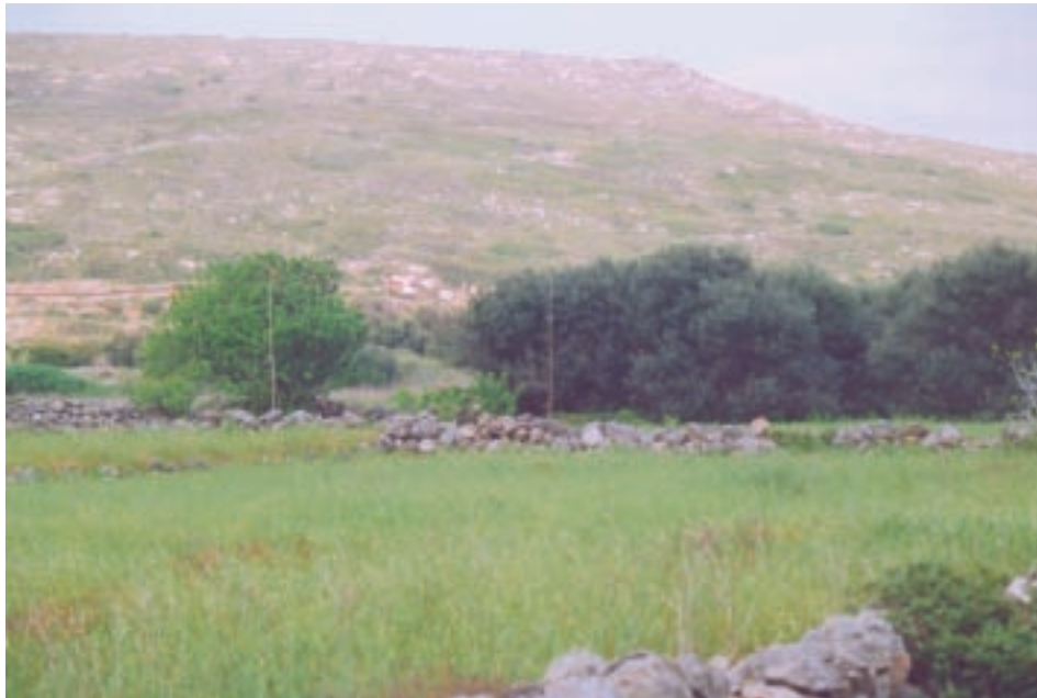
Plate II-1. A net site near cultivated land