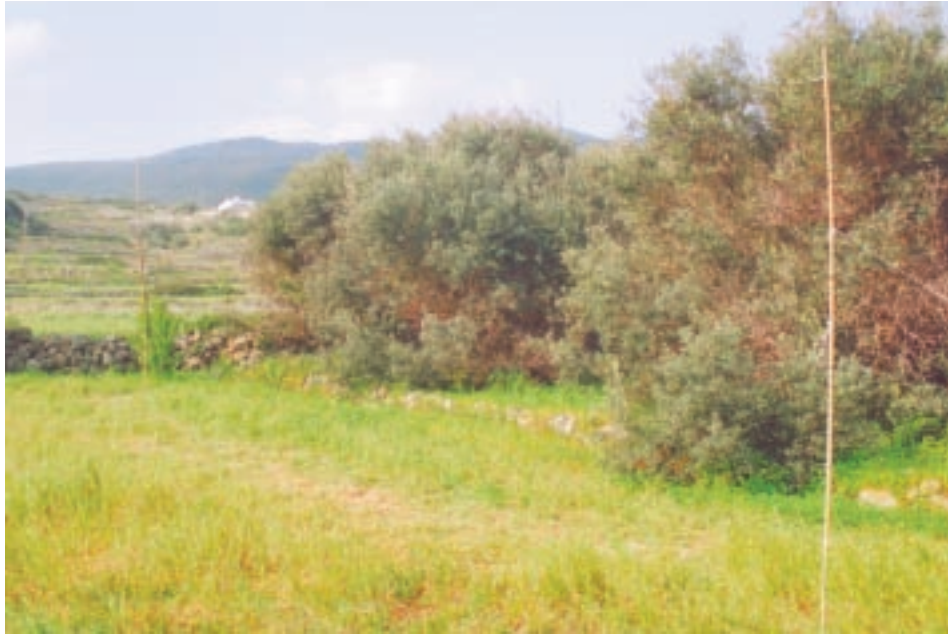
Plate I-1. A net site near an olive grove and a meadow